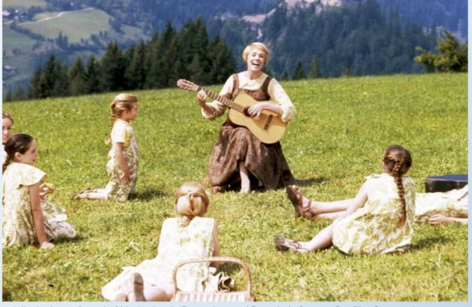
Julie Andrews, Sound of Music, Argyle Enterprises and Twentieth Century Fox Film Corporation